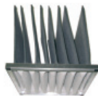
Particle and odour filter

Europe, Headquarters Lifa Air Ltd. Hämeentie 103 D 00550 Helsinki, Finland