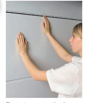
The door sections

The door sections are urethane foam filled, reducing the loss of conditioned air and increasing your energy savings.