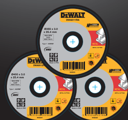
CUT OFF WHEELS FOR METAL