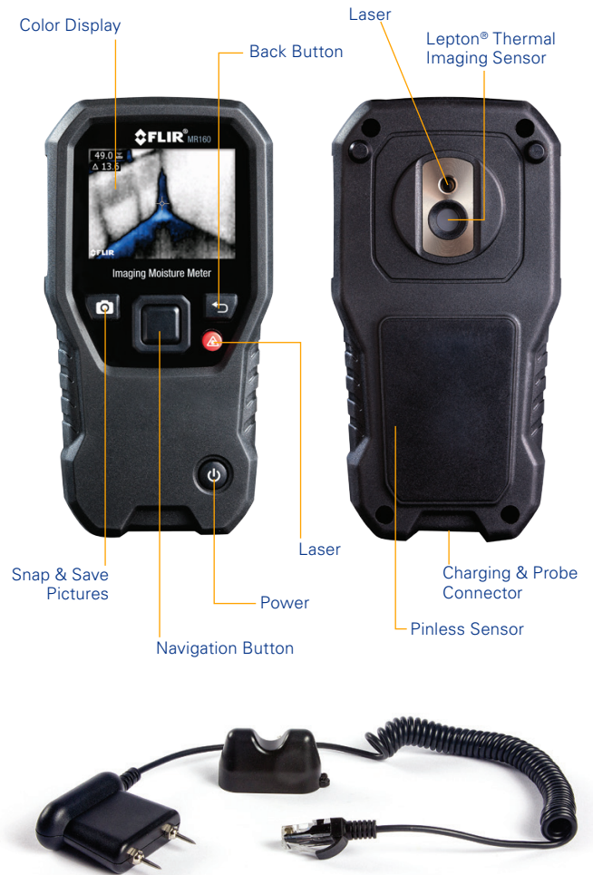
MR02 Pin Probe included

PORTLAND Corporate Headquarters FLIR Systems, Inc. 27700 SW Parkway Ave. Wilsonville, OR 97070 USA PH: +1 503.498.3547