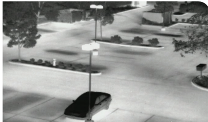
The most accurate intrusion detection and video alarm verification system available.