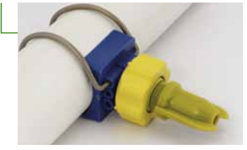
eHB-10-K attached to PVC pipe using an optional HBC-10 clip adapter