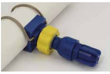
HB-10-K using an HB-10-K adapter, attached to PVC pipe using an optional HBC-10 clip adapter