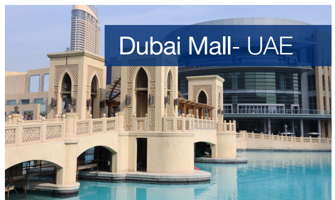
Dubai Mall- UAE