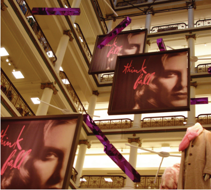
Signage and Shop Fitting