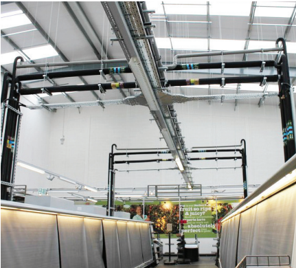
Food / Humid Environments