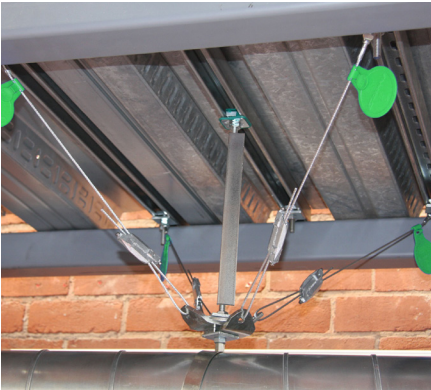
Seismic and Anti-Terrorism/ Force Protection