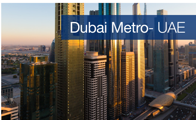
Dubai Metro- UAE