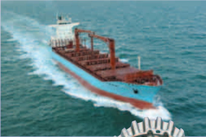
Plate Heat Exchangers for Marine Applications