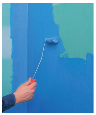
Apply undiluted Knauf Waterproofing to the substrate as a first protective coating to cover the entire surface.