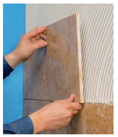
When the second coating of Knauf Waterproofing has cured completely, tiles and stones can be installed.