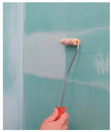
Priming absorbent mineral or gypsum-based substrates and plaster boards with Knauf Primer