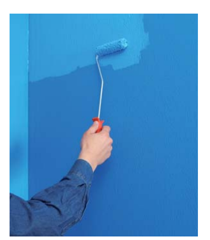
After complete curing of the first coating (approx. 6h) a second coating of Knauf Waterproofing is necessary.