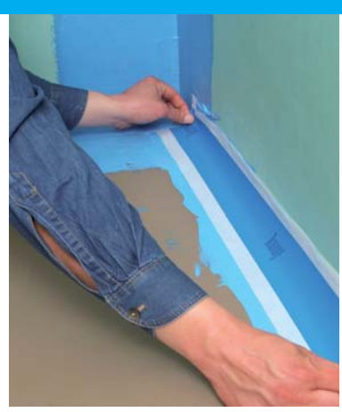
In case of wall/wall and floor/wall junctions Knauf Waterproofing Tape is applied the same way.