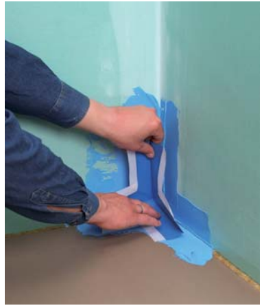
In corner areas Knauf Waterprofing Corner is embeded in a fresh applied coating of Knauf Waterproofing. Pipe connection are sealed with Knauf Pipe-Lead-in Gaskets.