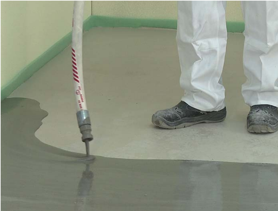
Pumping Knauf Self-Leveling Compound FIBERFLEX 15 using PFT RITMO.