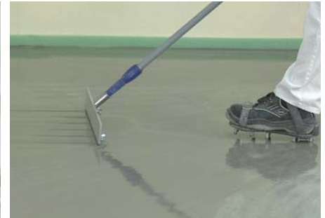
Adjusting film thickness with a tooth trowel