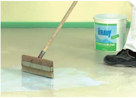
Priming with Knauf Screed Primer