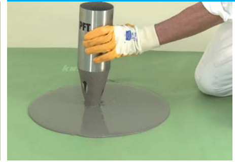
Checking consistency of Knauf FIBERFLEX 15