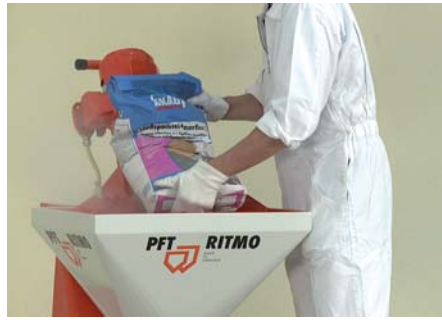
Filling PFT RITMO and adjusting the powder/water mixture