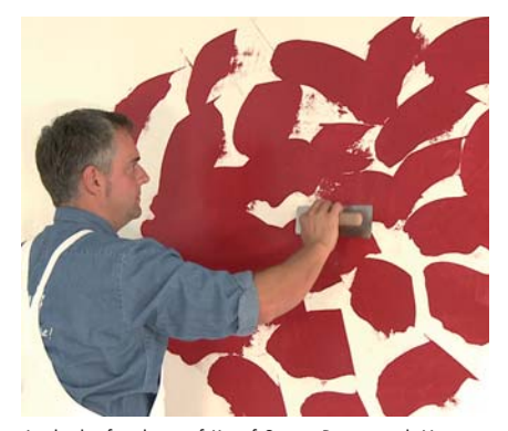
Apply the first layer of Knauf Stucco Design with Venetian smoothing trowel (crossways) thinly.