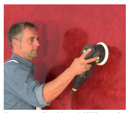
Alternative: manually sand down with P1200, remove dust und finally sand down using P2000 with the Rotex R0 150 FEQ of Festool.