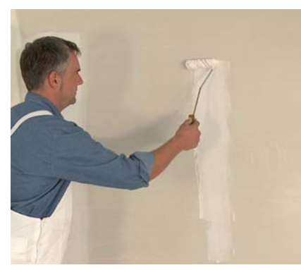
Prime substrates with Knauf Sperrgrund Block & Bond.