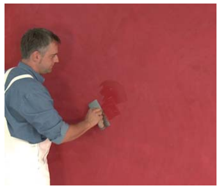
After drying the first layer apply the second layer the same way untill the desired gloss level is reached.