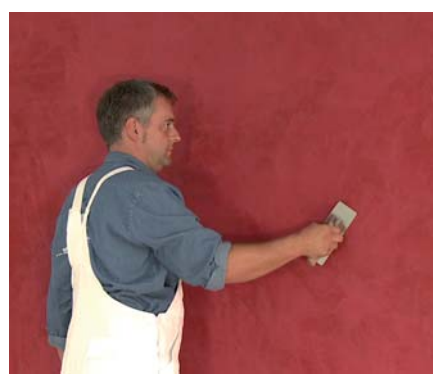
Remove dust and polish to a high gloss with the Venetian smoothing trowel.