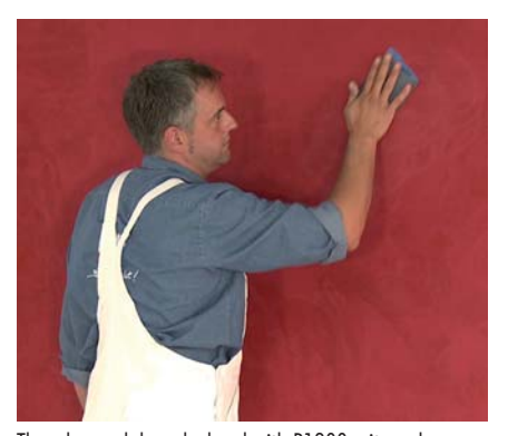
Then dry sand down by hand with P1200 grit sandpaper.