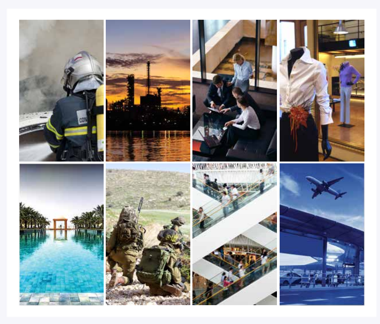
GOVERNMENT & CRITICAL INFRASTRUCTURE • DEFENSE, MILITARY & ENFORCEMENT AGENCIES • AIRPORTS OIL & GAS • RESIDENTIAL • CORPORATE • LUXURY HOSPITALITY • RETAIL • LUXURY RETAIL • BANKING

MVP Tech currently serves several business areas in demand for sophisticated systems regionally and internationally. Some of these areas include servicing capabilities for the following: