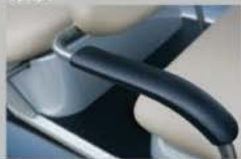
A soft armrest