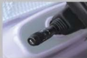
Lamps and switches