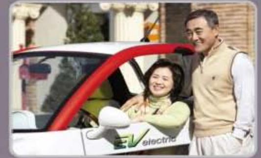
▶ A comfortable ride