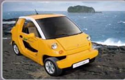
▶ Islands Transportation