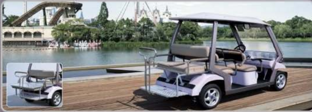
▶ On a group tour! – C ZONE Touring Car