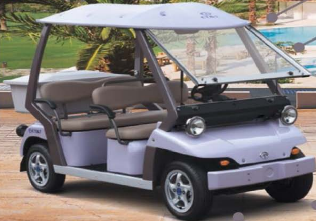
c-ZONE Utility Car for 6 (Violet)

The environmentally-friendly electric car without concerns worries about the maintenance cost, c-ZONE not only provides a convenient move but also protects health and environment.