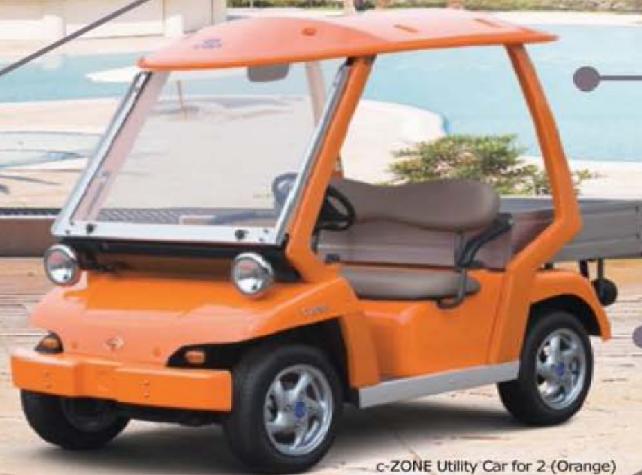
c-ZONE Utility Car for 2 (Orange)