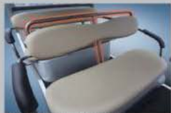
One frame support seat