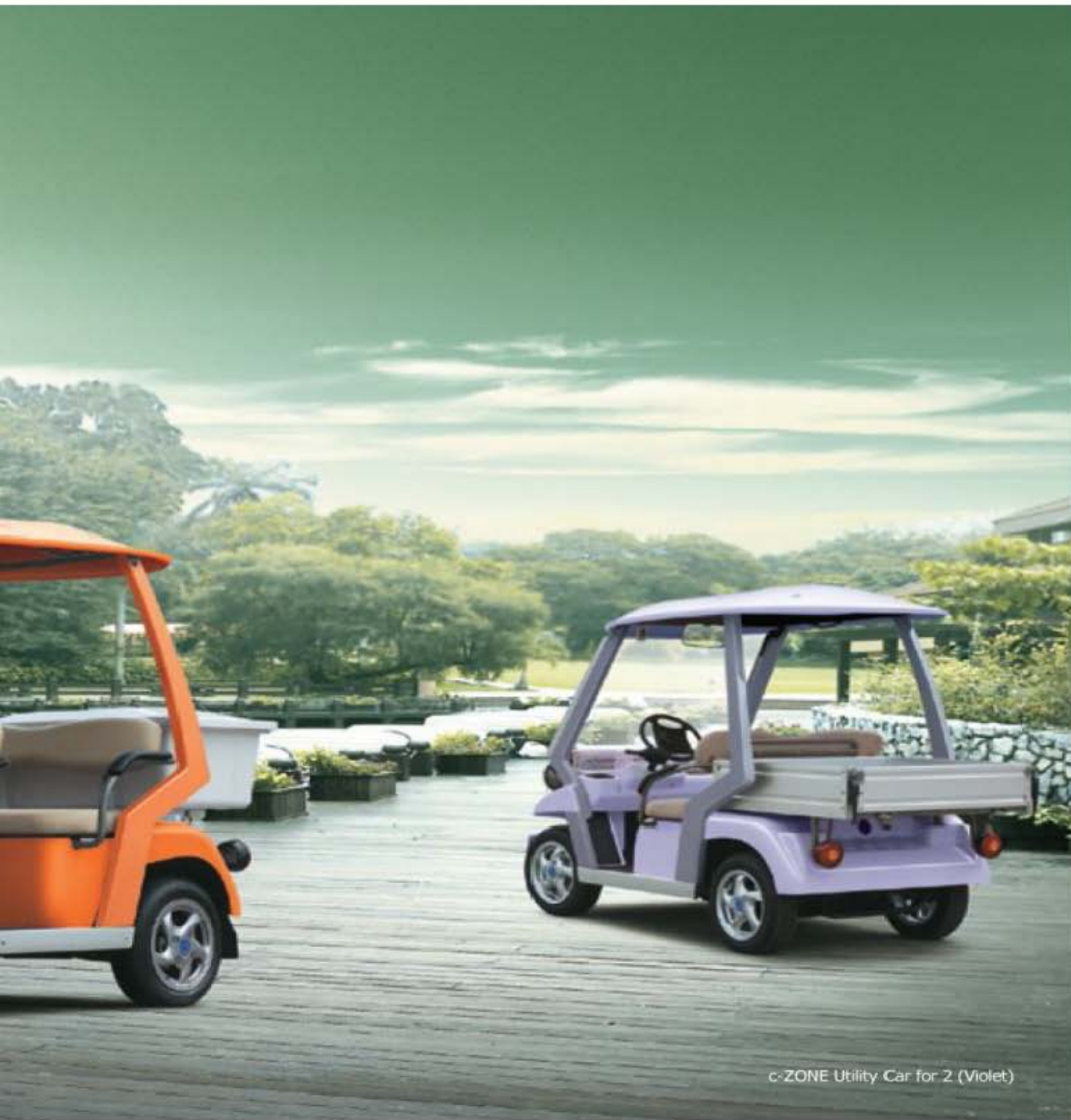
c-ZONE Utility Car for 2 (Violet)