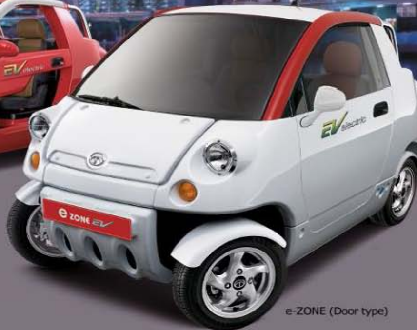
e-ZONE (Door type)

A new standard of a electric car for the next generation