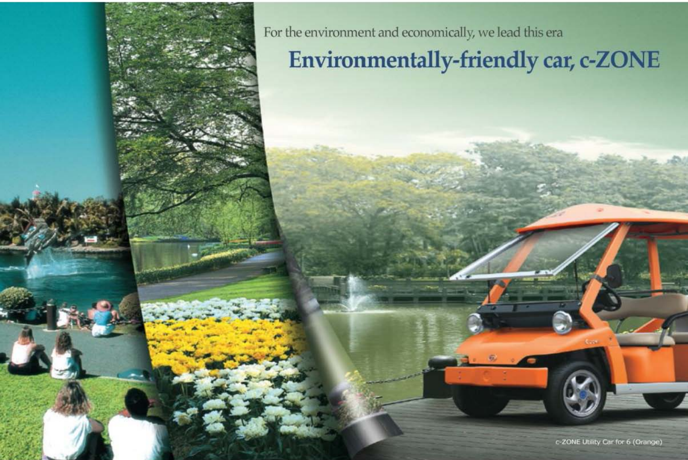
c-ZONE Utility Car for 6 (Orange)