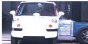
Passed Side Crash Test

e-ZONE is the first and the only NEV which satisfies international regular passenger car crash test requirements.