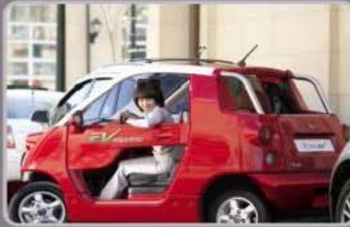
▶ Tight parking spot? No problem!