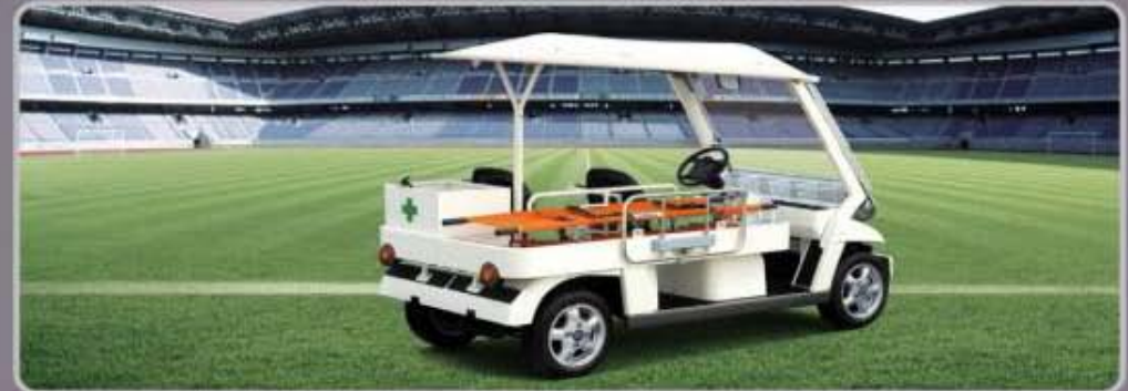
▶ Dealing with emergencies promptly! – C ZONE Ambulance