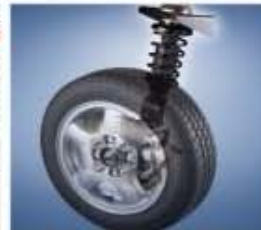
Four-Wheel Independent suspension system for smooth ride