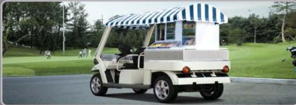
▶ Managing customer services with Mobile Cafeteria! – C ZONE Cafeteria