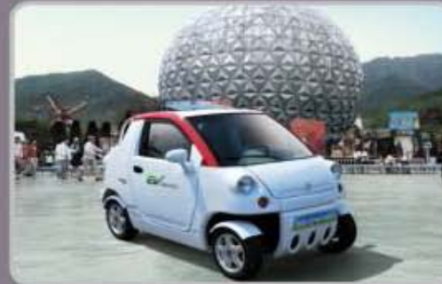
▶ Amusement and theme parks