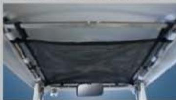
Net in the roof