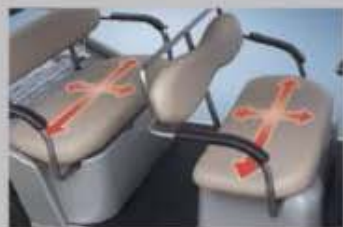
Wide seat width possible to accommodate 6 people