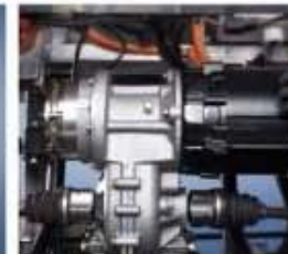
High-Efficiency Main motor and Gear reducer