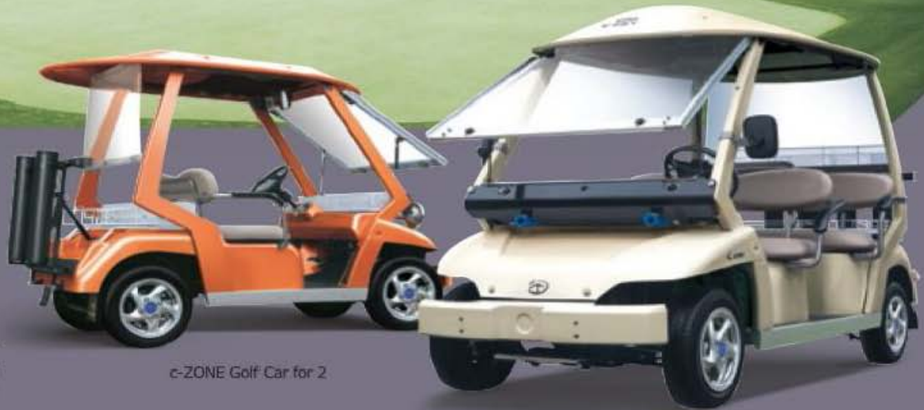
c-ZONE Golf Car for 2

The c-ZONE which is being acknowledged as a golf car of the next generation leading the global golf car market through the CT&T's exclusive high technology. It has brought about an innovation in the golf car market with its outstanding performance, beautiful design. Also, currently, the hype of c-ZONE is being created in overseas as well.