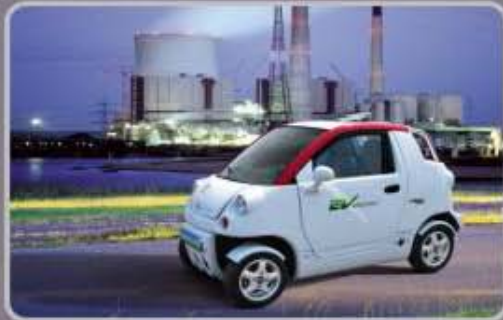
▶ Ideal for large commercial and campus facilities