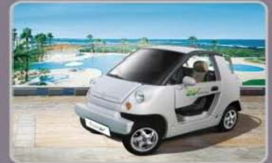
▶ A great option for planned communities and residential neighborhoods