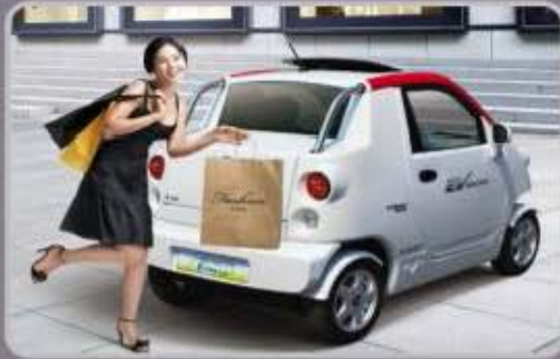
▶ Great for shopping...