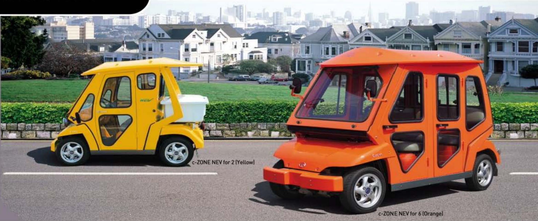
c-ZONE NEV for 2 (Yellow)

With GREEN to BLUE c-ZONE NEV / c-ZONE SPECIALLY EQUIPPED