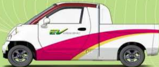
e-VAN Pick up