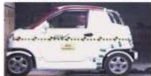
Passed Frontal Crash Test

▶ Passed and got the high score in the crash test of Frontal & Side by the Official Traffic Safety Administration's International Safety Standards.