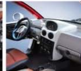
Driver friendly interior