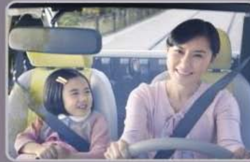
▶ On the way to school