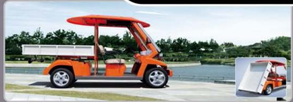
▶ Powerful and Extensible deck! – C ZONE Long-Deck