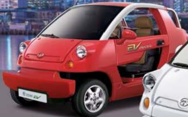
e-ZONE (Bar type)