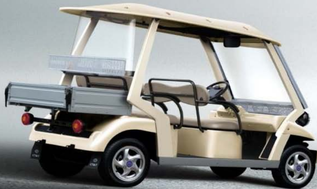
c-ZONE Utility Car for 6 (Ivory)