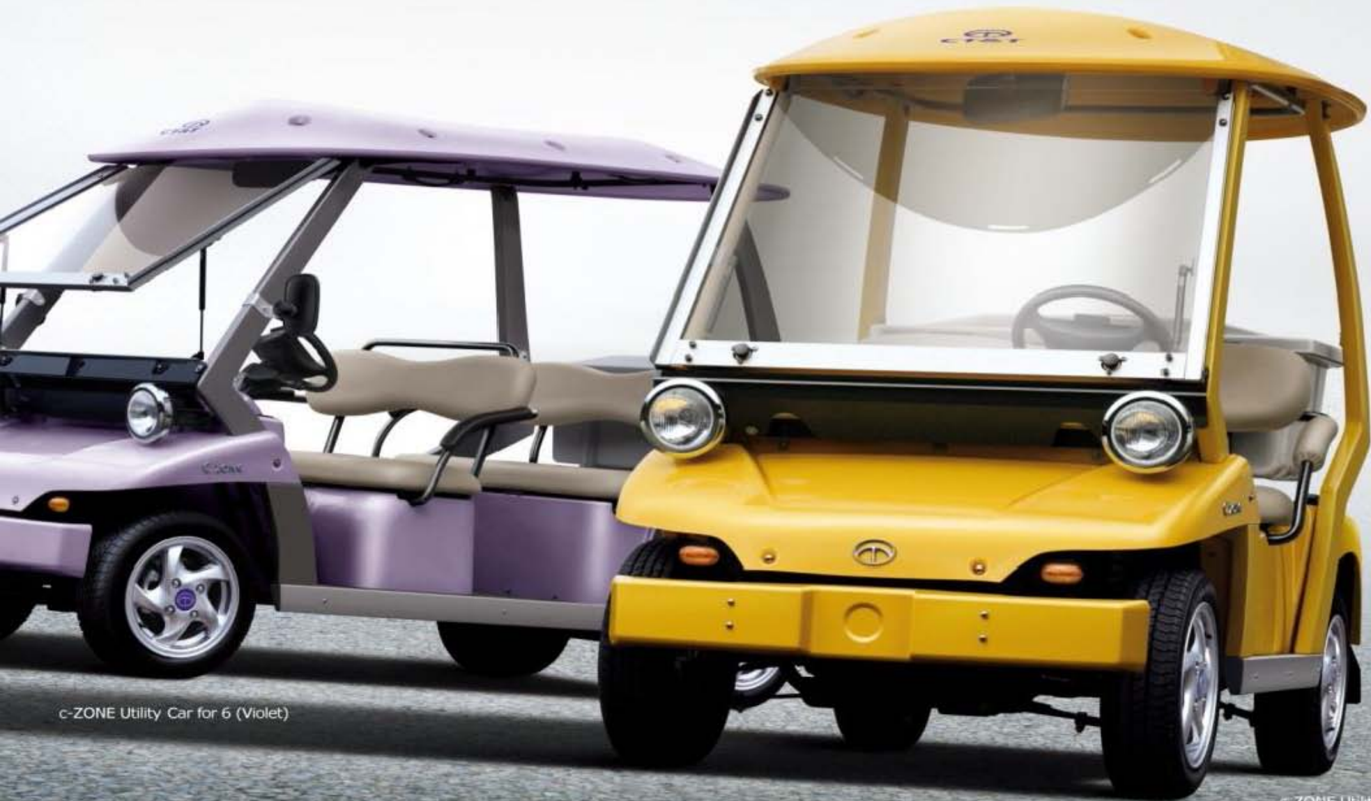
c-ZONE Utility Car for 6 (Violet)

A harmony of human, nature, and high technology It is the reason c-ZONE is a leader in the utility car industry which is recognized by the world