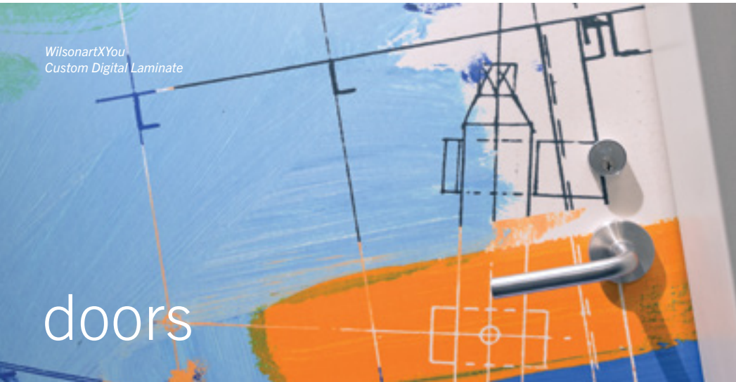
WilsonartXYou Custom Digital Laminate

As you design and build, our solutions help create beautiful, hard-working professional and personal spaces.