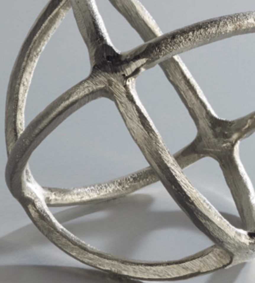
Wilsonart Decorative Metal Satin Brushed Natural Aluminum 6257

Wilsonart, a world-leading engineered surfaces company, is driven by a mission to create surfaces people love, with service you can count on, delivered by people who care. The company manufactures and distributes High Pressure Laminate, Quartz, Solid Surface, Coordinated TFL and Edgebanding, and other engineered surface options for use in furniture, office and retail space, countertops, worktops and other applications. Operating under the Wilsonart®, Resopal®, Polyrey®, Arborite®, Laminart®, Bushboard®, Ralph Wilson® and Durcon® brands, the company continuously redefines decorative surfaces through improved performance and aesthetics.