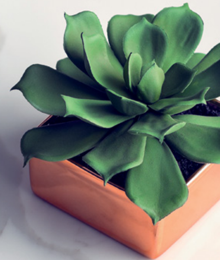
Wilsonart Quartz Lucca Q4027L

Dedication to our customers, each other and the communities where we live and work.