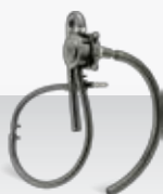
Open Crankcase Ventilation