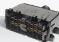
Direct Flow Air Filtration with Nanofiber Media