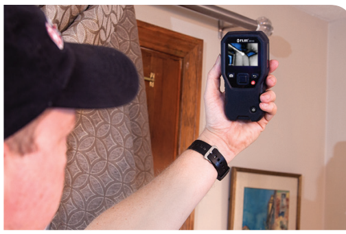
Scanning ceiling & wall joint for moisture issues