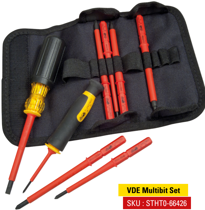
VDE Multibit Set